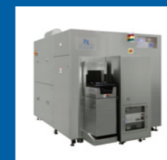
Photomask Dimension Measurement System

We meet the needs of the semiconductor industry by providing semiconductor design circuit measurement on photomasks and defect review/analysis equipment, and units that are indispensable for semiconductor manufacturing.