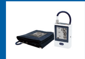
Portable Automatic BPM