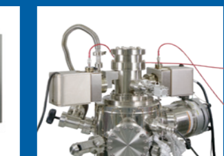
Nanoelectronics Manufacture and Control