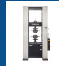
Tensile and Compression Testing Machine

Based on the technology of analog-to-digital signal conversion, our measurement and weighing equipment business offers diverse products and solutions that support various sectors, such as automotive and energy.