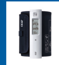
Upper Arm BPM

Our medical and healthcare equipment division is at the forefront of providing state-of-the-art medical monitoring devices on a global scale. As this sector undergoes significant digital transformation, we are committed to delivering an extensive array of solutions aimed at upgrading healthcare systems and accelerating the expansion of telemedicine services.