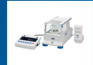
Electronic Micro Balance